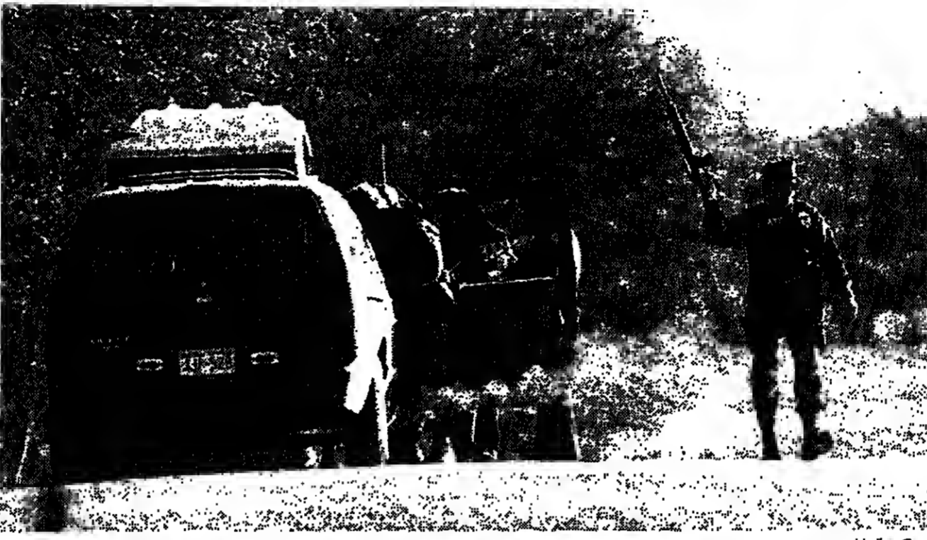
Agents from the U.S. Bureau of Alcohol, Tobacco and Firearms, manning a road checkpoint near Waco, Texas.

"It would be a disaster," said an administration official who helped put together the plan. "A total, unmitigated disaster. That's all I can say."